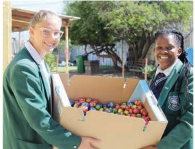
Hermies sharing the Easter love.

Thankfully we had to leave before the sugar fuelled their energetic personalities even more. We are already counting down the days till next year's Easter party at Yomelelani Primary School.