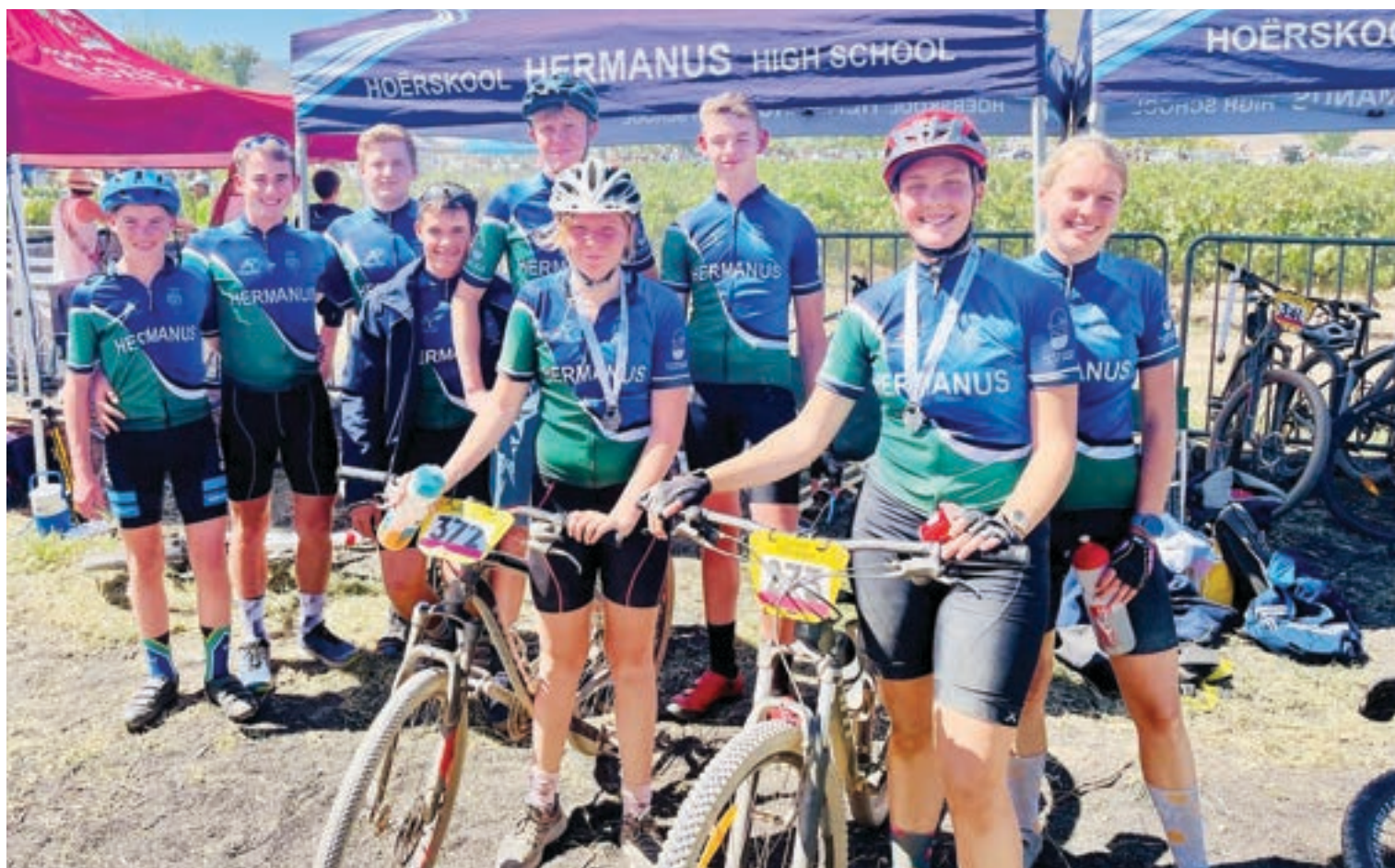
Our enthusiastic cycling squad.