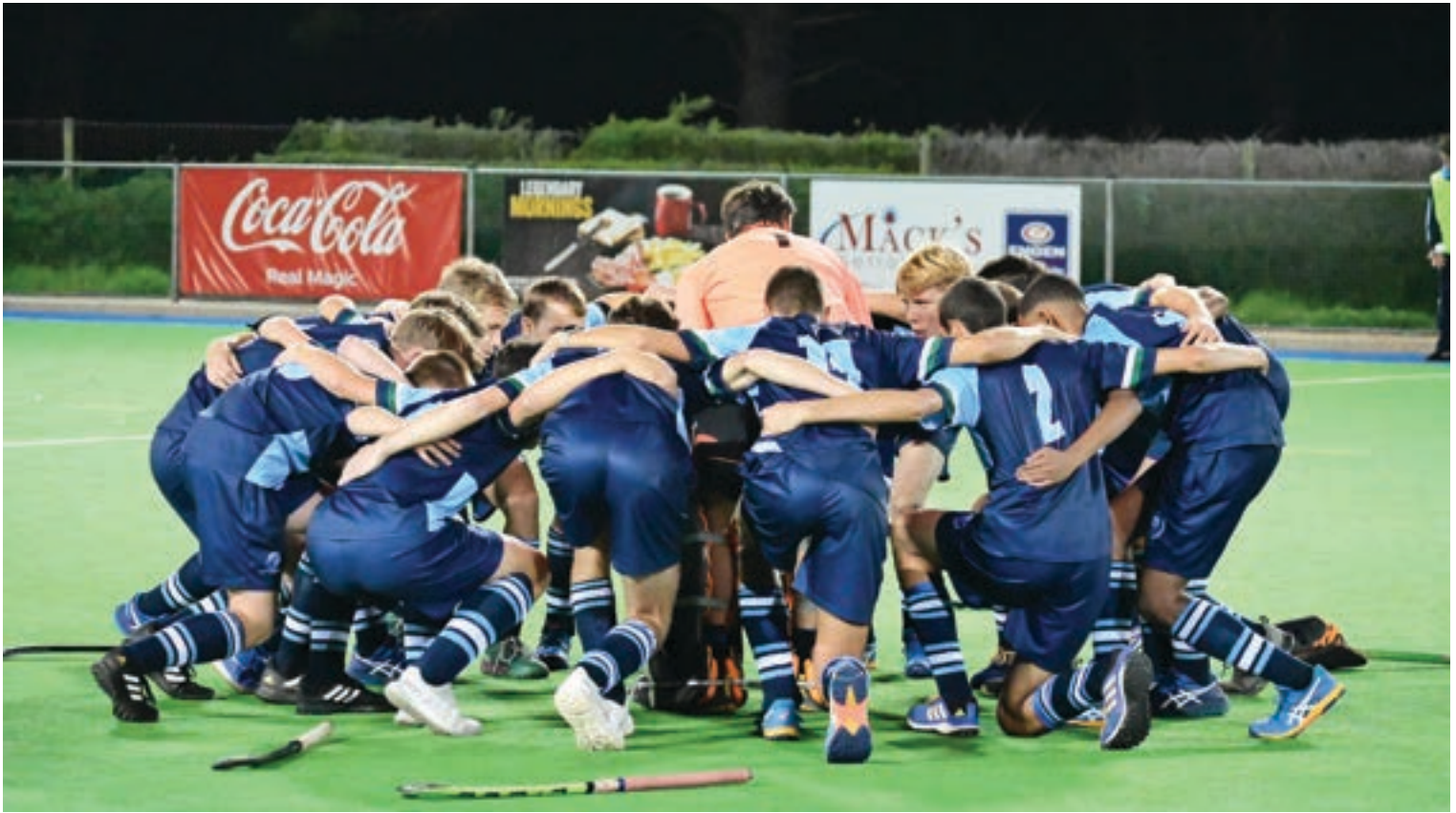
First Team Hockey Boys doing their warcry.