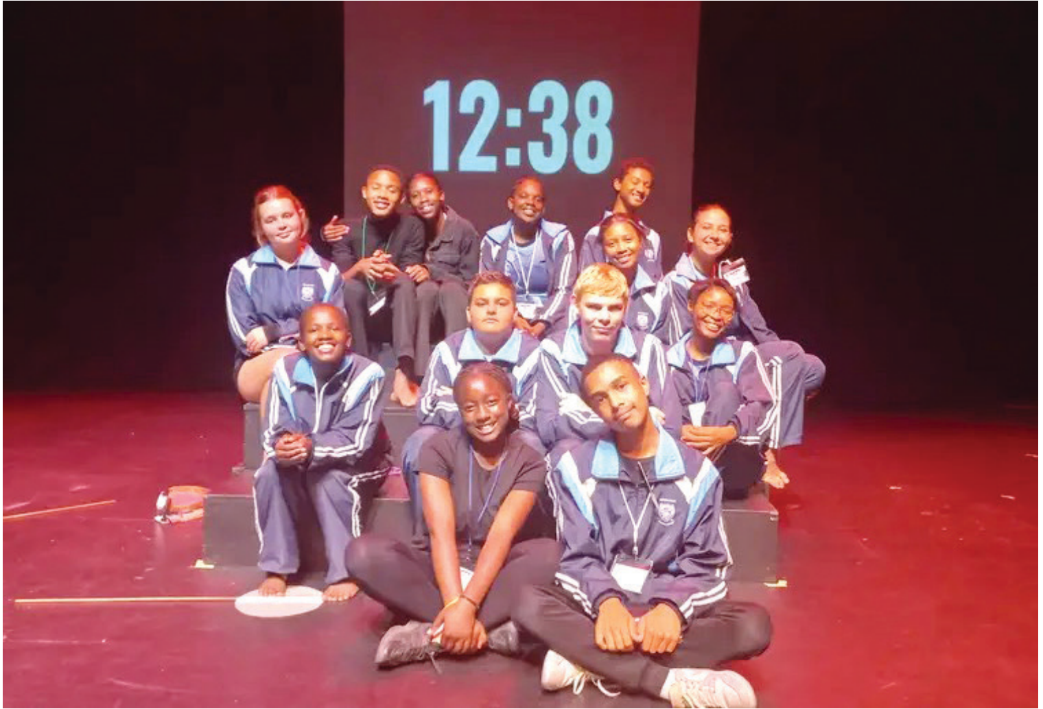
The learners that performed at the Homecoming Centre in Cape Town.