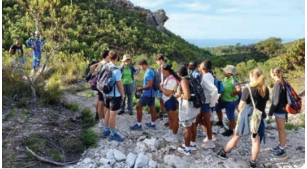
Hermanus Hoërskool lewenswetenskap leerder besig met praktiese leer.

betrokke geraak by die praktiese eksperimentering en het die verskeie faktore wat planttranspirasietempo's beïnvloed, geondersoek. Hierdie praktiese ervaring was 'n goeie geleentheid om die visuele uitbeelding van transpirasie waar te neem.